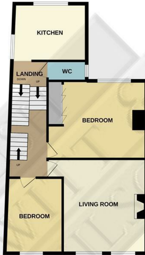
1ST FLOOR 764 sq.ft. (71.0 sq.m.) approx.