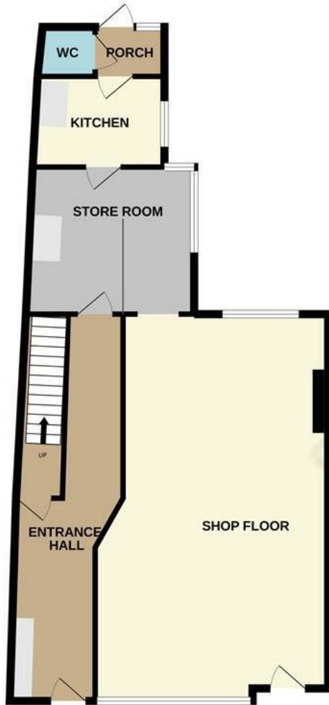
GROUND FLOOR 838 sq.ft. (77.9 sq.m.) approx.